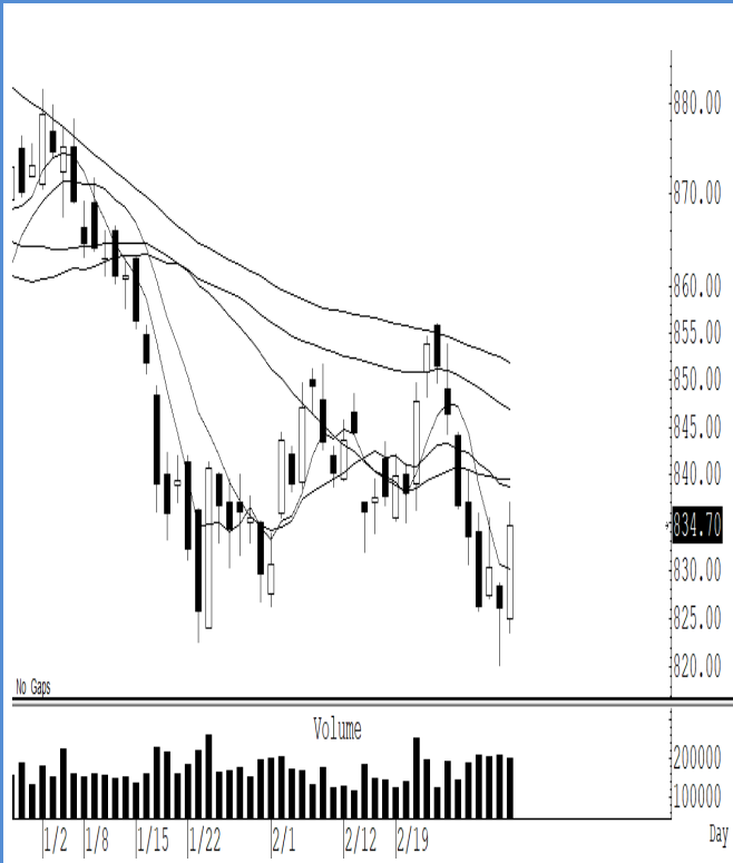
S50H24 (Close 834.70 Chg 8.60)